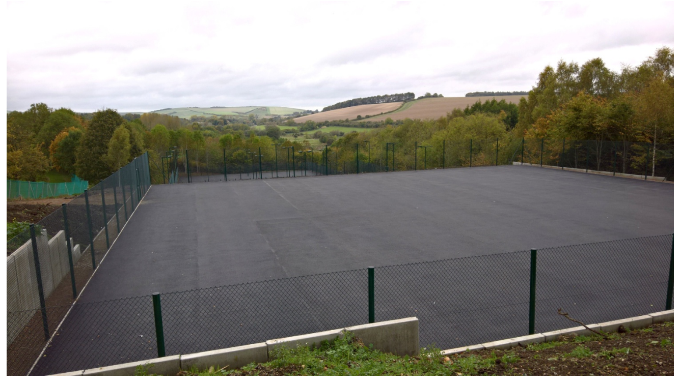
13<sup>th</sup> October 2017